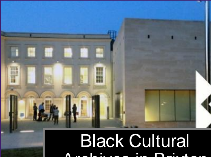
Black Cultural Archives in Brixton